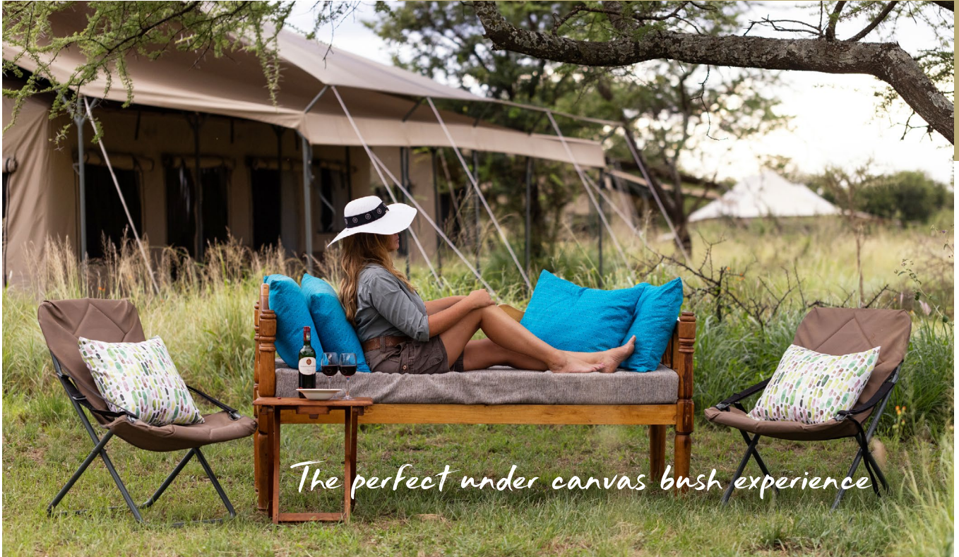
The perfect under canvas bush experience

Our classic tented camp in central Serengeti boasts a prime location overlooking a wildlife-rich valley with a permanent water source. Relax in peaceful seclusion away from the busier central areas, while still enjoying easy access to prime game-viewing spots. With abundant resident wildlife, high predator activity and the migration often passing through camp, you'll savour superb food, a relaxed atmosphere and warm Tanzanian hospitality. Carefully designed to minimise its environmental footprint, this eco-friendly camp uses solar power for lighting and gravity-fed, solar-heated showers to conserve water.